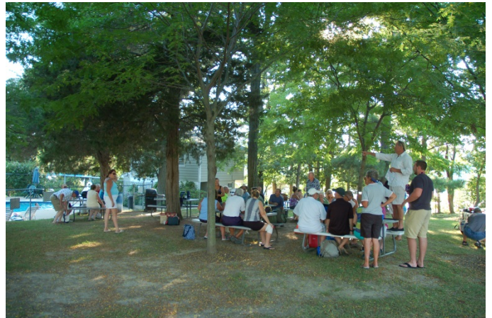
Dinner and Conversation