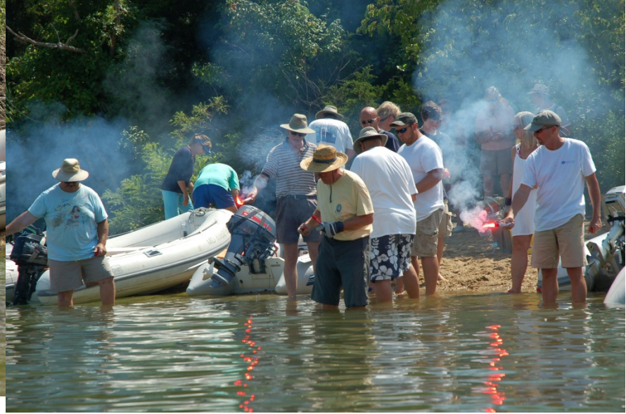
Practicing continues and continues