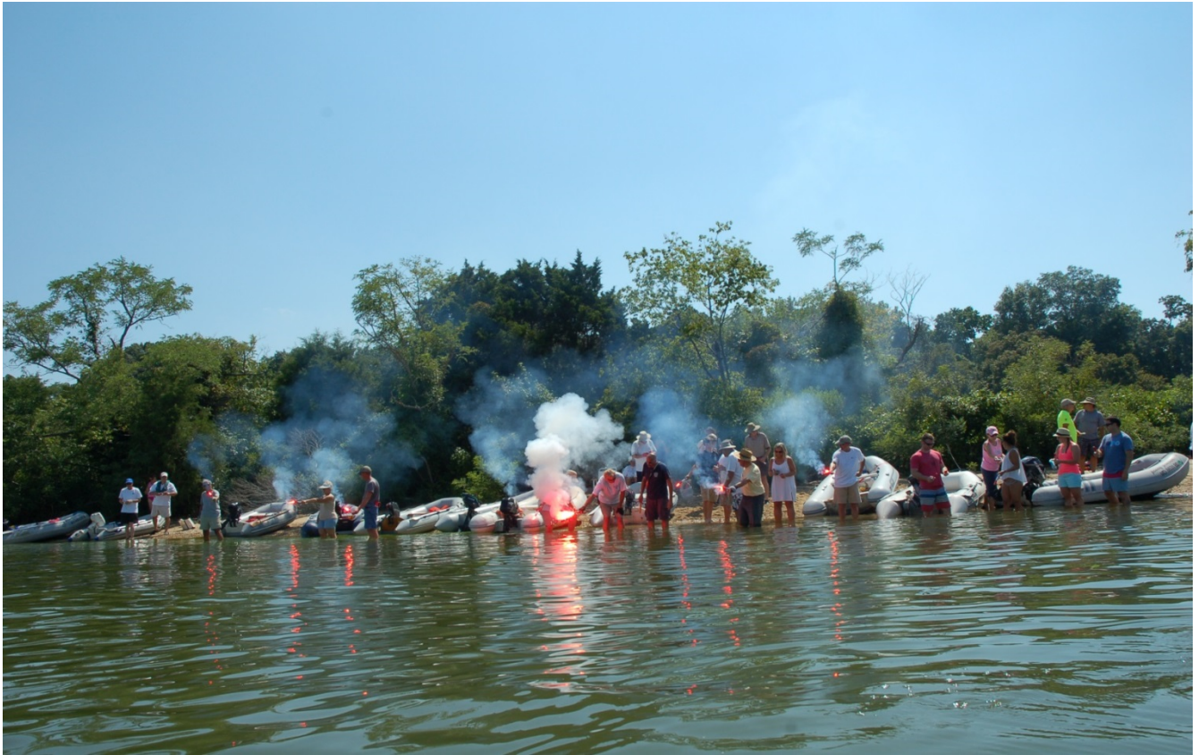
Now everyone is lighting up!