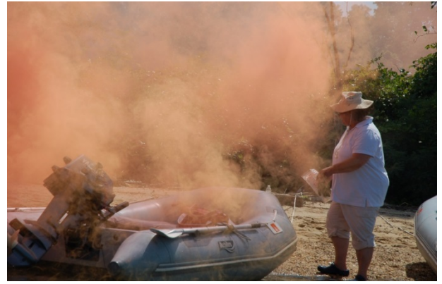
Cough, Cough, Cough....