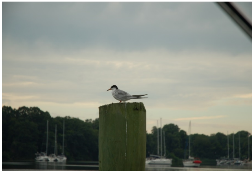
Sunday - Quiet again returns to Worton