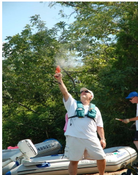
Lots of Aerial Shots 'Heads Up Champagne'