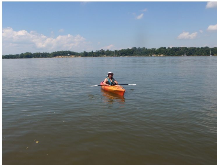
Our hard working, paddling photographer

The Safety Exercises were held on the Bay side of 'R2" on the south shore close to the old dock ruins. Flare and Aerial exercises were conducted in ankle deep water.