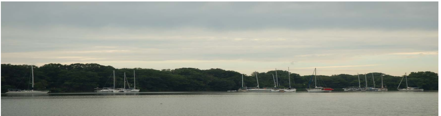
Worton Creek Anchorage